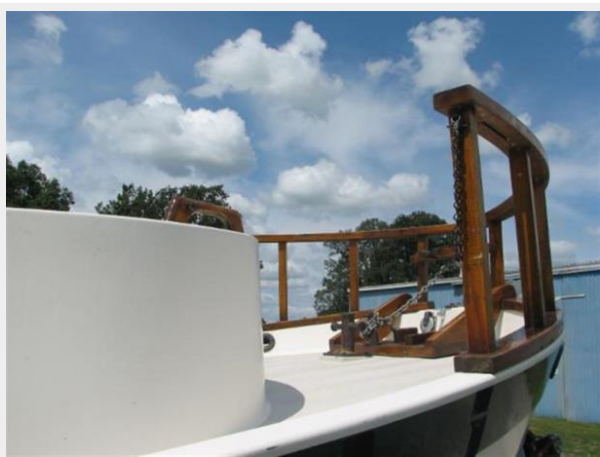
Forwad Ddeck Railing