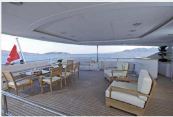
Large aft deck