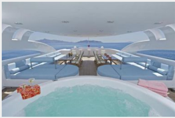
Sundeck looking fwd