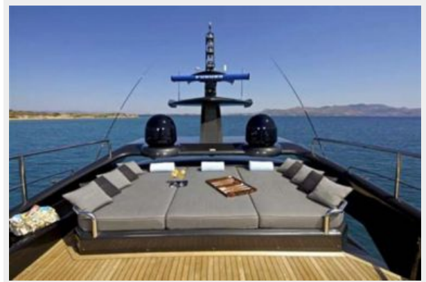
Sundeck lounging area