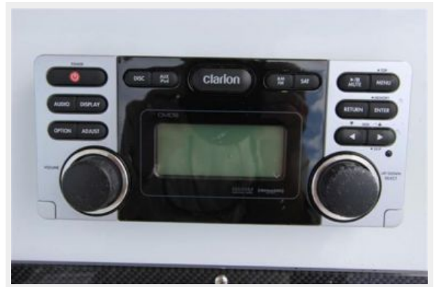
Clarion CMD8 Marine Stereo