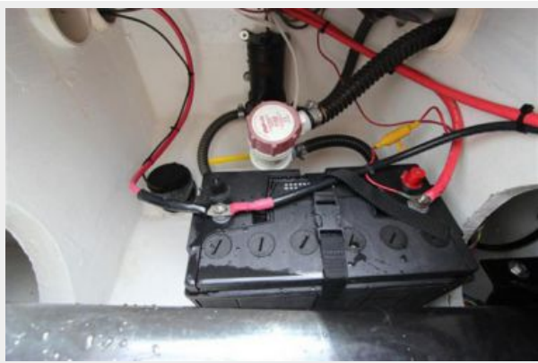
Port Side Battery Compartment