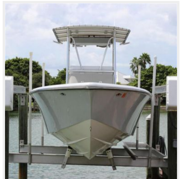
No Bottom Paint