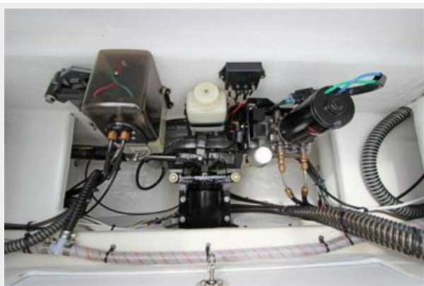
Aft Rigging Compartment