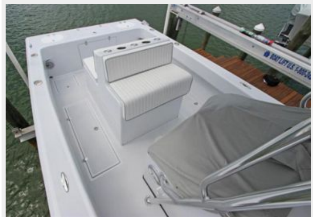
Engine Cover W/Integrated Helm Seating