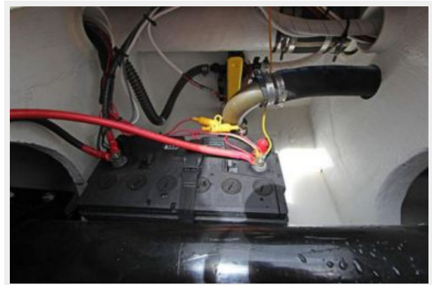
Starboard Side Battery Compartment