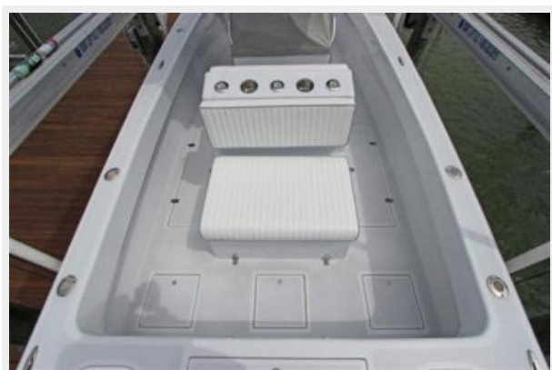
Rear Facing Seating On Engine Cover