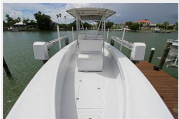
Large Cockpit Looking Aft