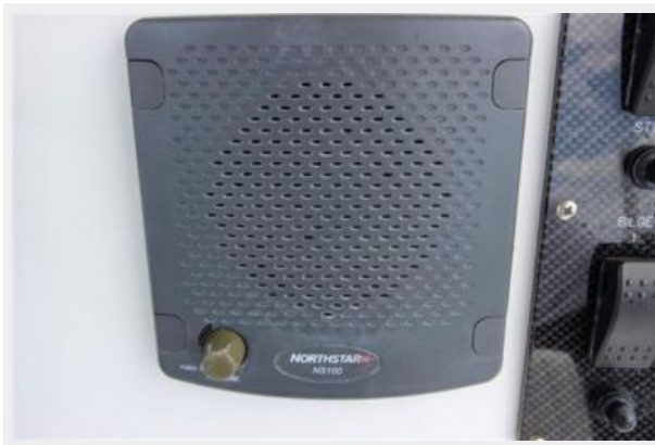
Northstar VHF Marine Radio