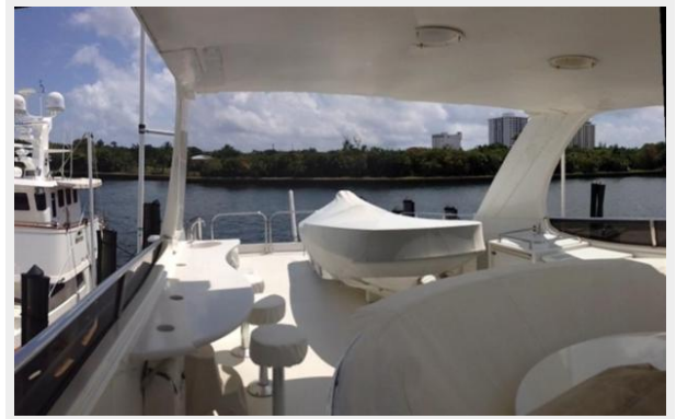
Bridge Looking Aft