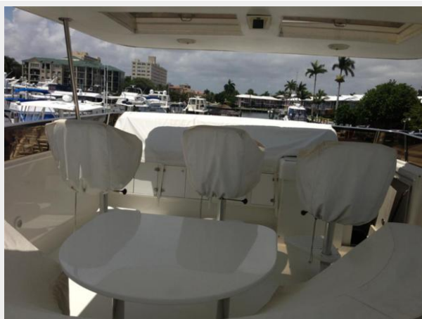
Bridge Looking Fwd