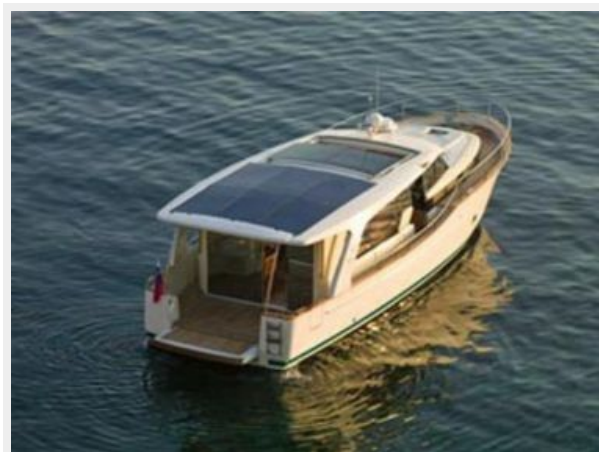
Super Displacement Hull Performance

The extended cabin roof gives full protection from the sun, rain or wind. An optional canvas cover enlarges the living space in colder seasons.