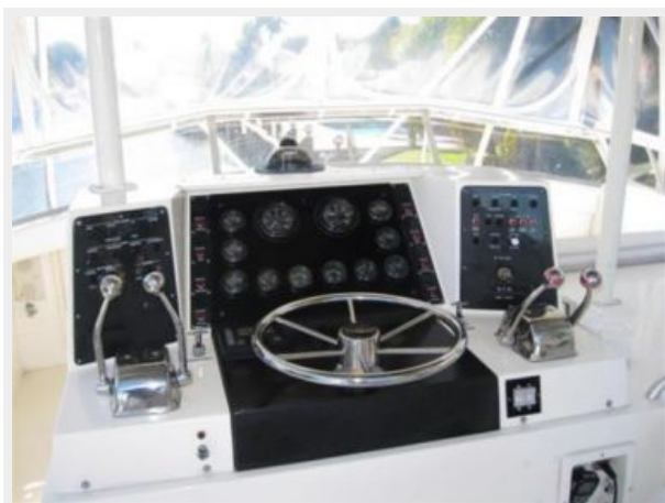
Helm backlit guages