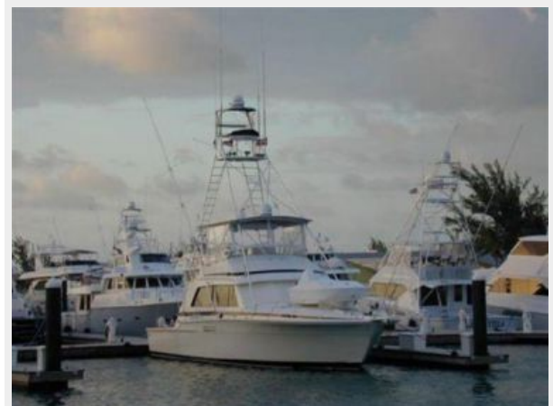
At Dock in Bahamas