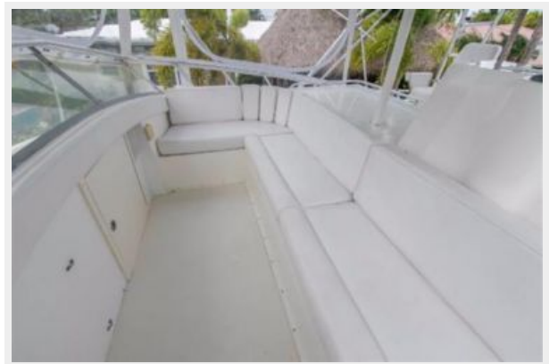
FORWARD HELM SEATING - New isinglass enclosure.