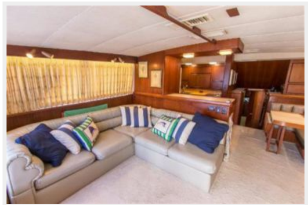
CUSTOM SALON DOOR