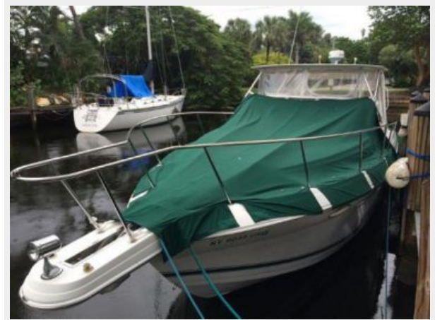
Awsome custom hard top