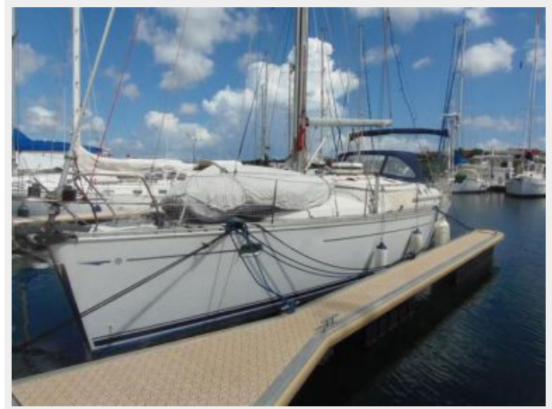
Jeanneau 43 Ds for sale port