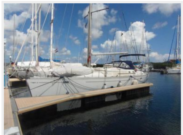
Jeanneau 43 Ds for sale port