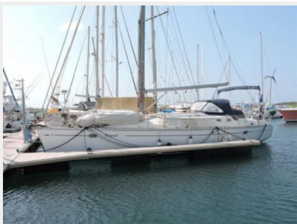
Jeanneau 43 Ds