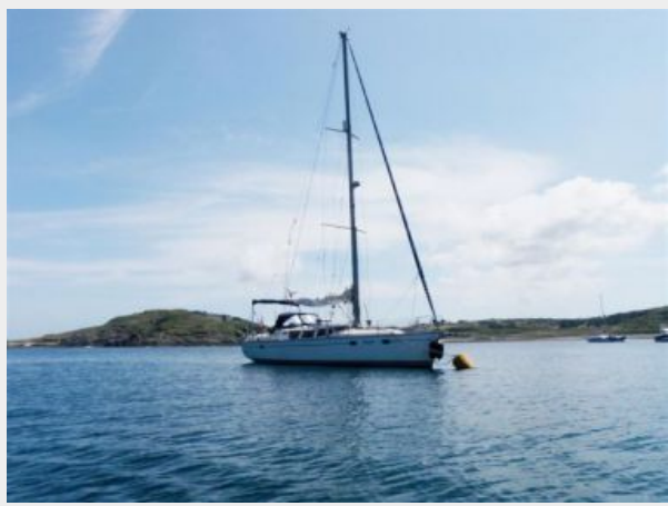
Jeanneau 43 Ds for sale caribbean