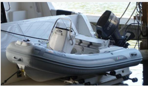
AB Inflatable tender w/40hp Yamaha