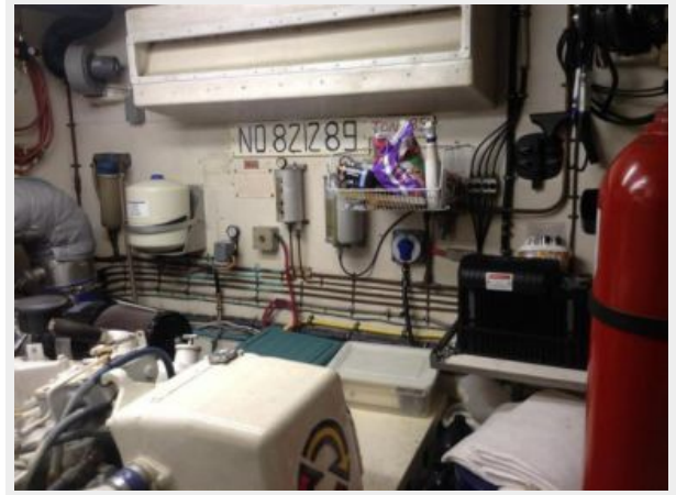
Port Engine Room