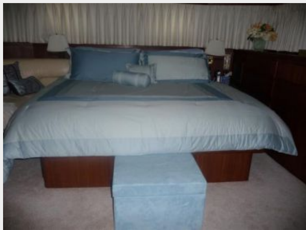
Master Cabin Looking Aft