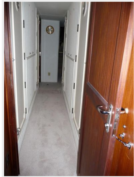
Companionway Looking Forward