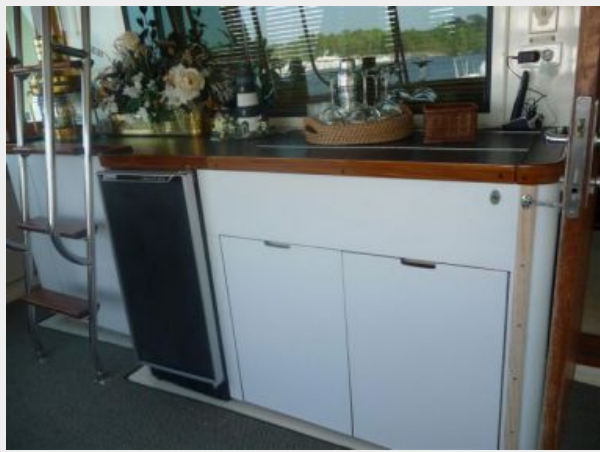
Aft Deck Bar