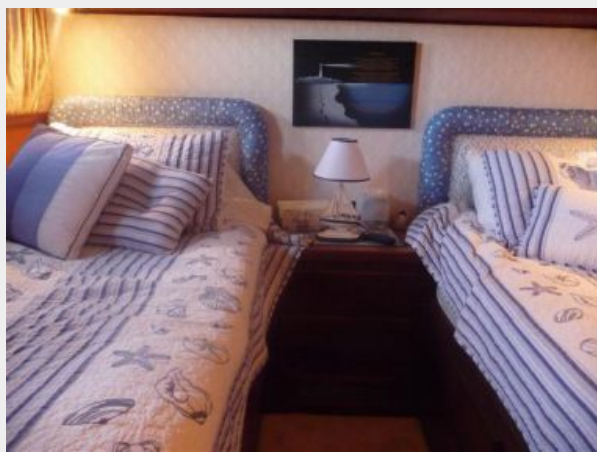
Mid Guest Cabin