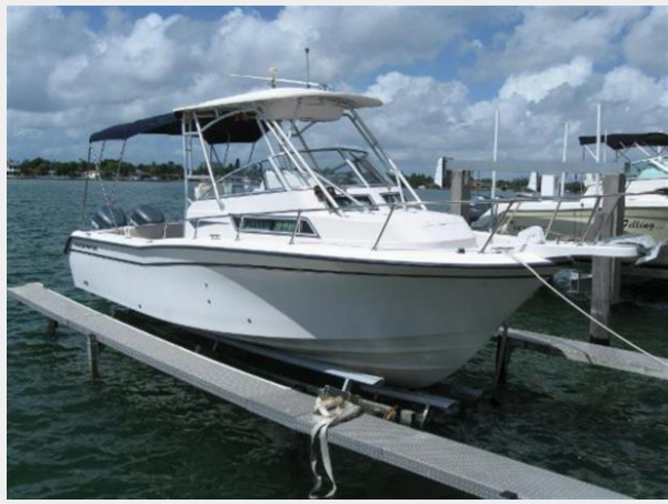
On the Lift