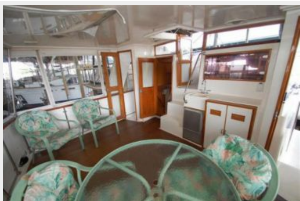
Aft Deck Fwd