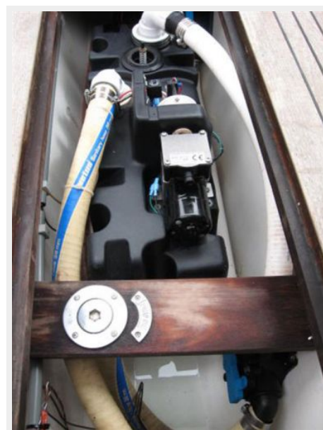
Sea-Land Head system