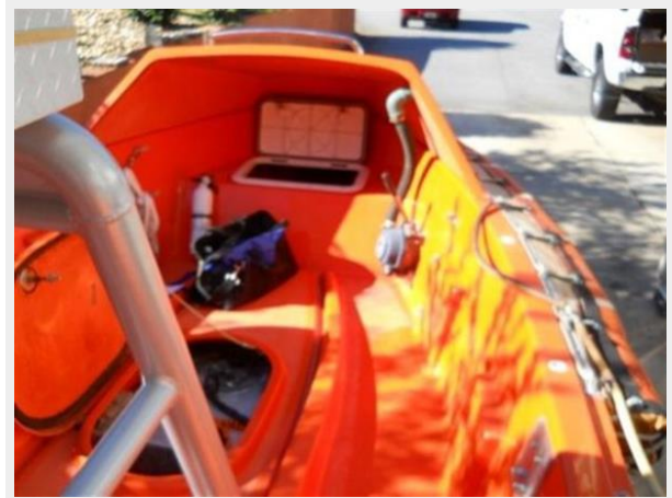
Access Hatch to the center console