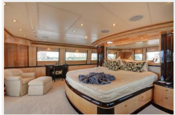
Master Stateroom, Upper Deck