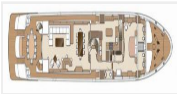
Main Deck Layout