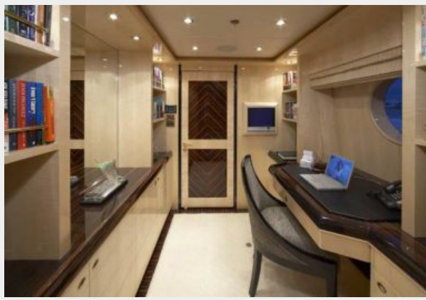
Master Stateroom Office, Upper Deck