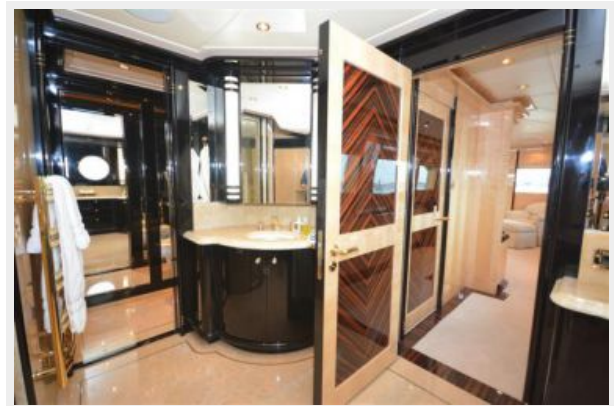
Master Bath, Upper Deck