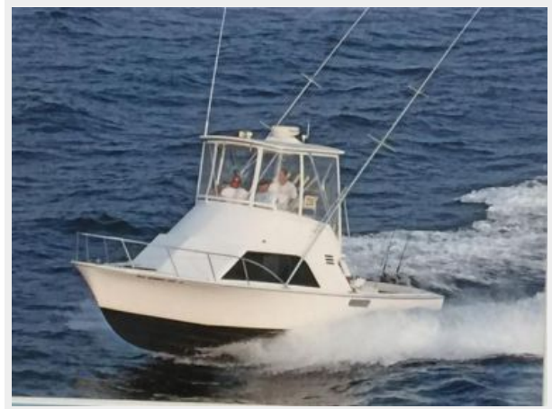
Profile 3 - Running Profile