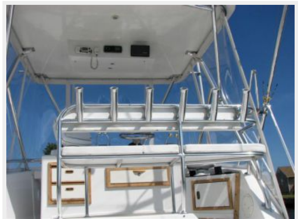
Cockpit / Fishing Equipment 1 - Tower Rocket Launcher