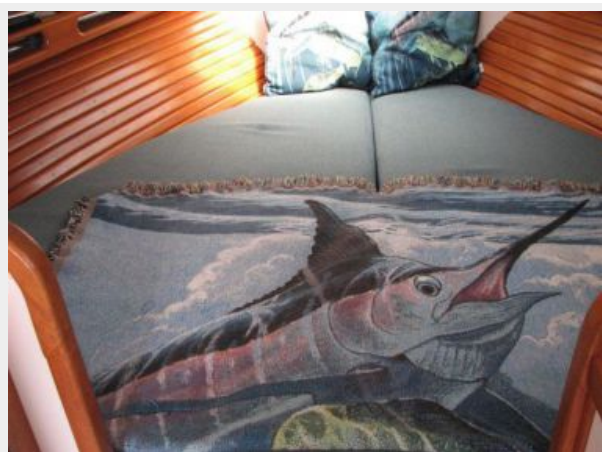
Main Cabin 3 - V-Berth