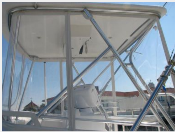
Deck 1 - Enclosure