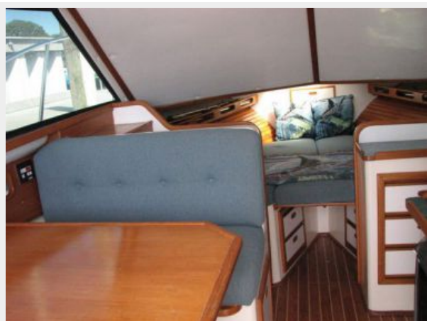
Main Cabin 1