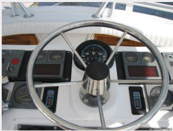
Helm / Electronics & Navigation 1