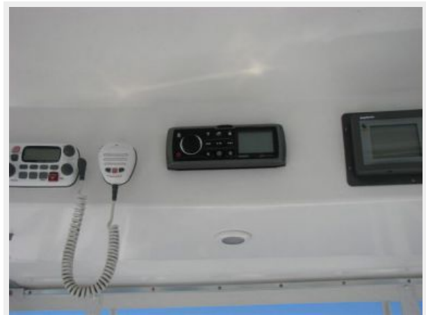
Helm / Electronics & Navigation 2 - Overhead Electronics