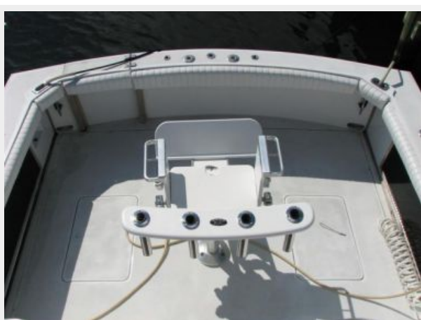
Cockpit / Fishing Equipment 2