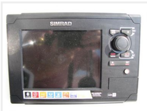
Helm / Electronics & Navigation 3 - Simrad NSS7