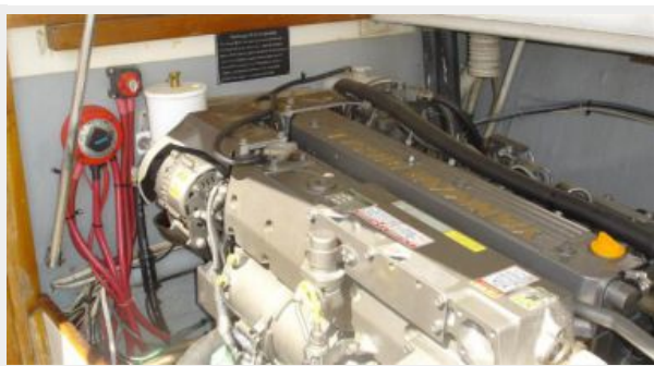
Engine & Mechanical Equipment