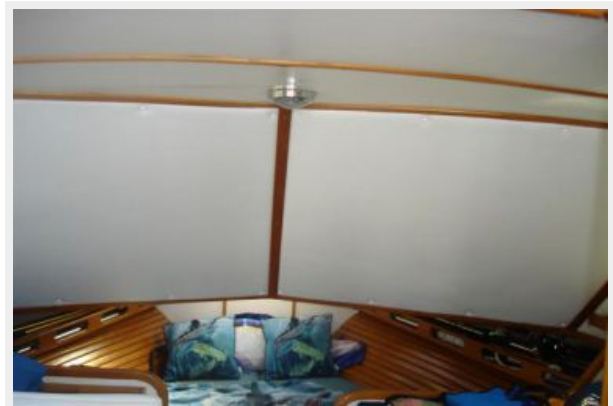
Main Cabin 2 - V-Berth