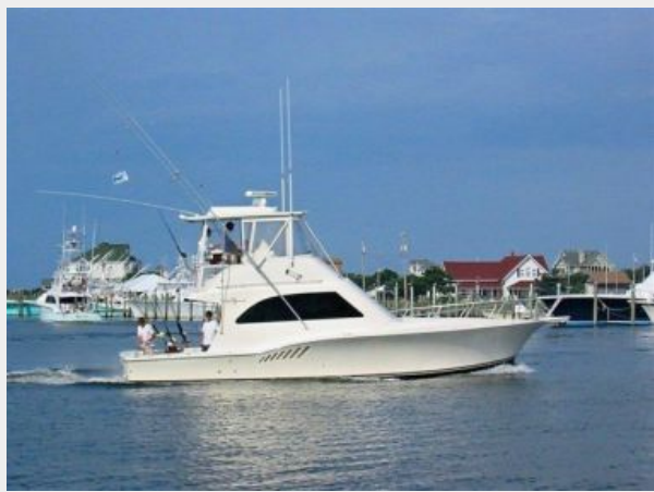
Returning from a day of fishing