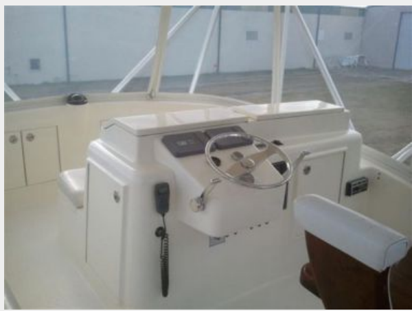
Bridge Console with actuated Electronics panels, Release Teak Helm Chairs