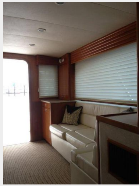
View Port and Aft, custom window treatments