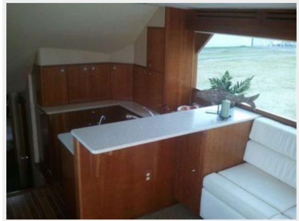
View Stbd and Fwd, ultra leather upholstery and Corian countertops