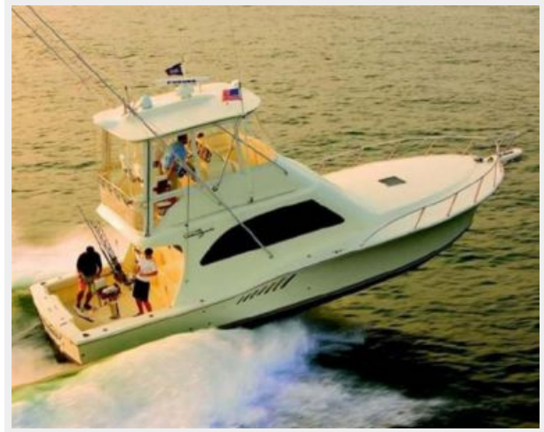
up and running, 30 kt. cruise / 35 kt. WOT