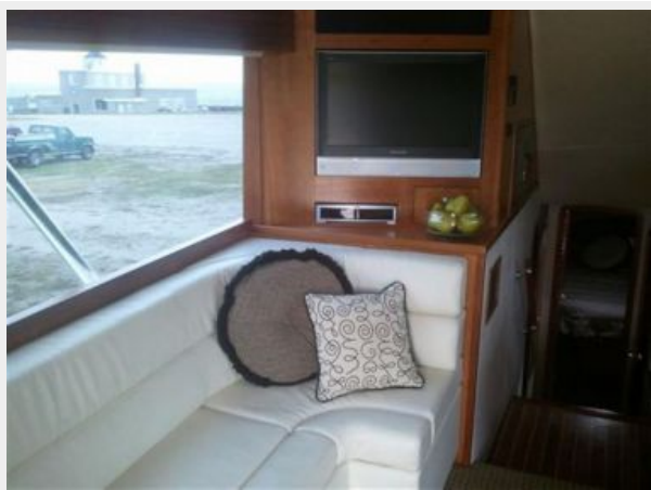
26" Flatscreen, View Port and Fwd