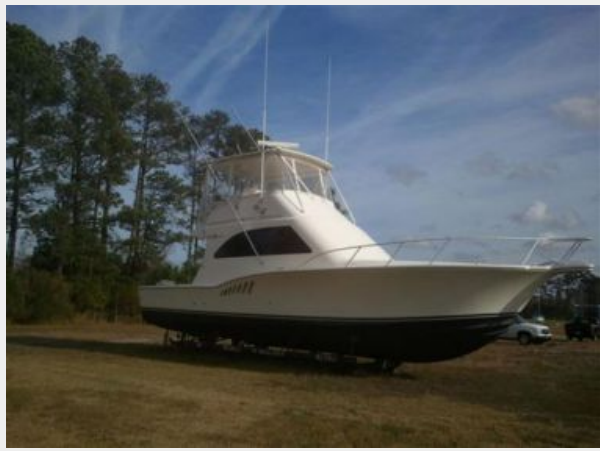
Out of the water view