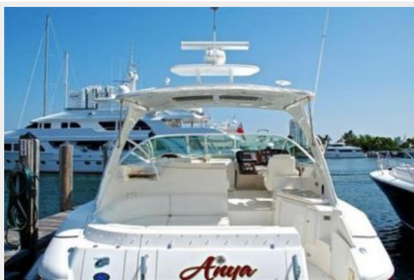
COCKPIT VIEW 1