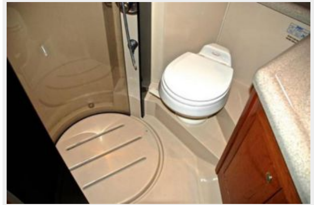
VIP ENSUITE SHOWER