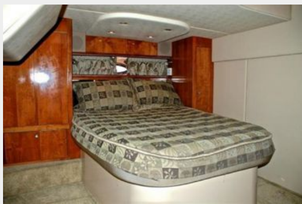
MASTER STATEROOM VIEW 1