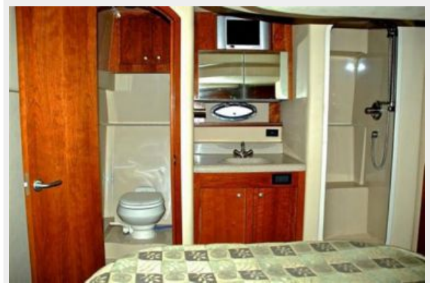
MASTER STATEROOM VIEW 2