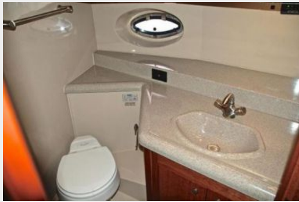
VIP ENSUITE HEAD