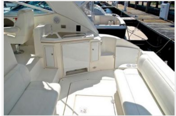
COCKPIT WET BAR