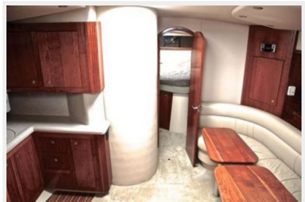
CABIN FWD VIEW