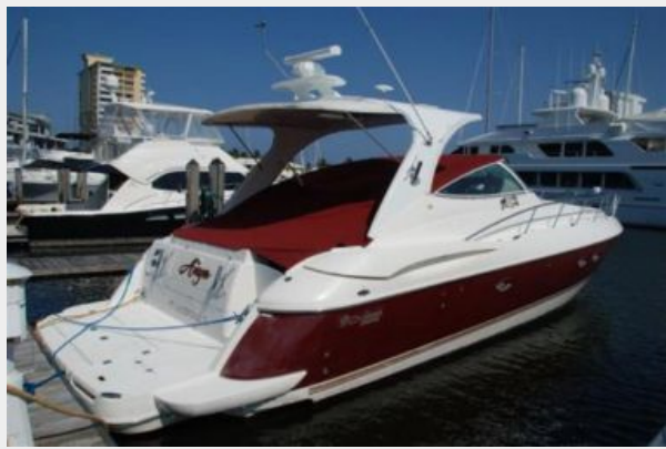
VESSEL STBD VIEW