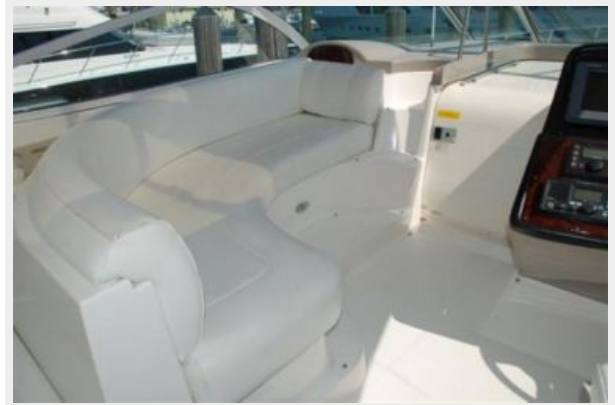
CABIN ENTRY DOOR