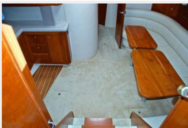
CABIN ENTRY STEPS