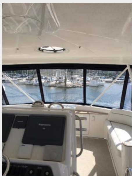
Bridge View Looking Forward