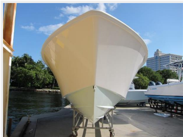
35 Contender ST