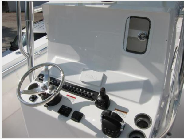
Helm w/ Joystick control