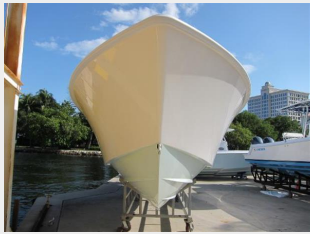
35 Contender ST