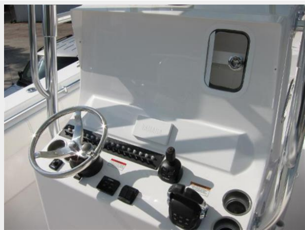
Helm w/ Joystick control