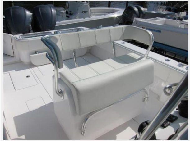
Leaning post w/ backrest upgrade