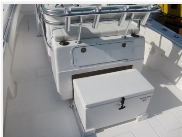
Slid out cooler