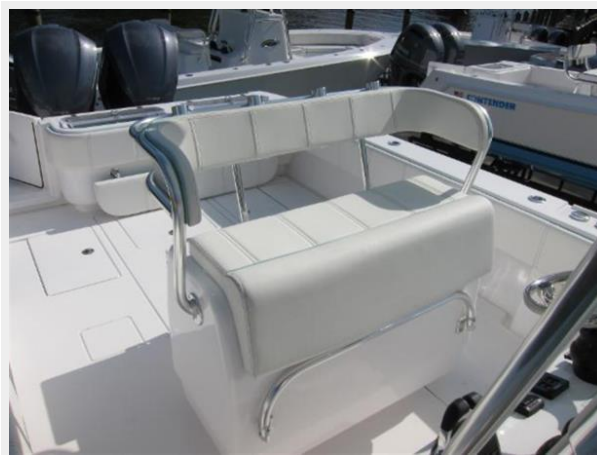
Leaning post w/ backrest upgrade