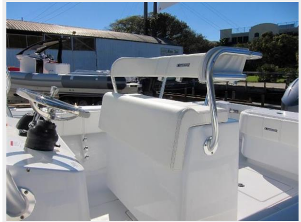
Leaning post w/ backrest bolster