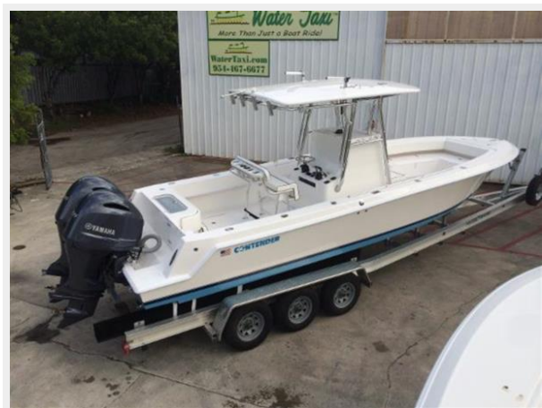
Contender 28 Sport