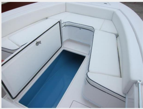
Insulated Fish Box