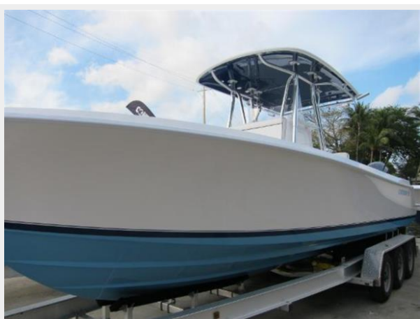
Sky Blue bottom, Aristo blue boot stripe