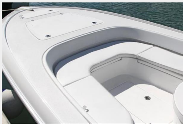
25 Bay forward seating and casting deck