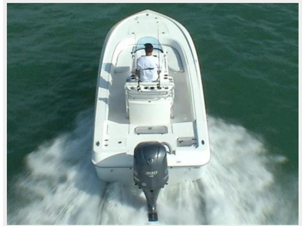
25 Bay forward seating and casting deck