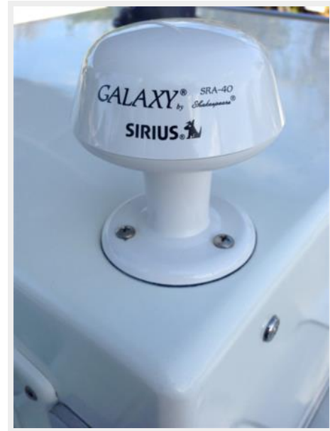
Satellite Radio Capable