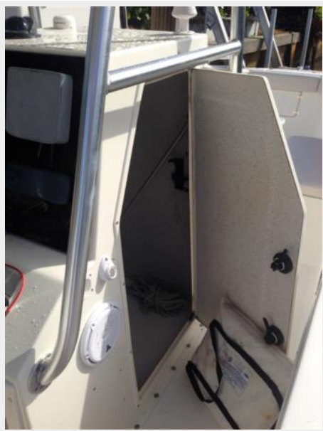
Head under console