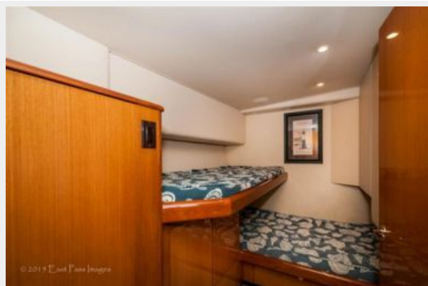
Starboard Bunk Room