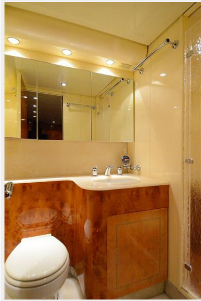
Master Bath Hers