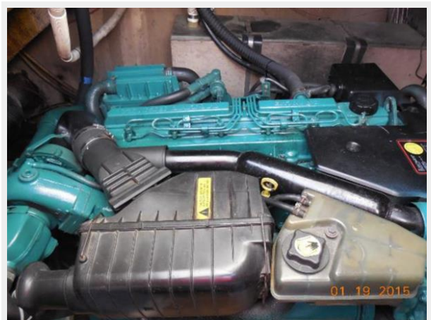
34' Luhrs Open, stbd side engine