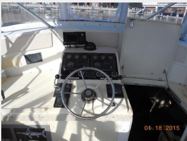
34' Luhrs Open, main helm station