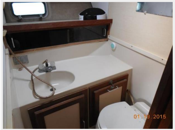
34' Luhrs Open, enclosed head/shower