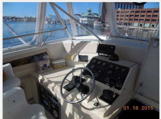
34' Luhrs Open, port side of helm