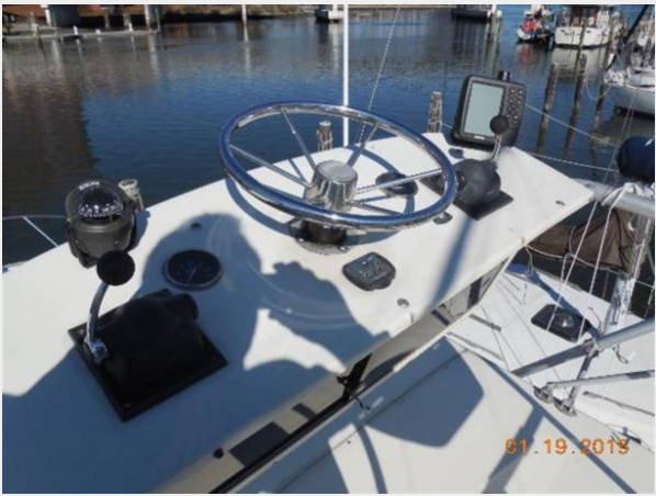
34' Luhrs Open, tower control station