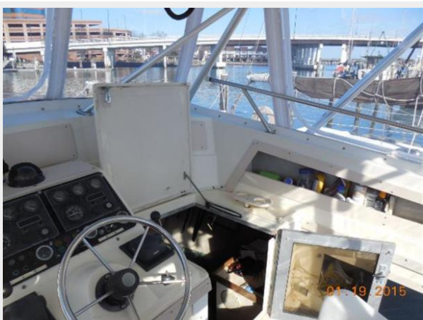
34' Luhrs Open, stbd side of Helm