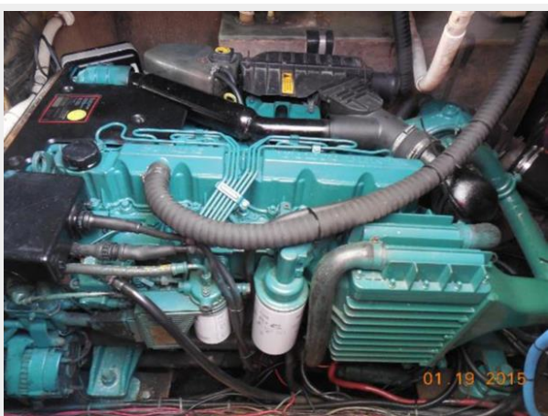
34' Luhrs Open, port side engine