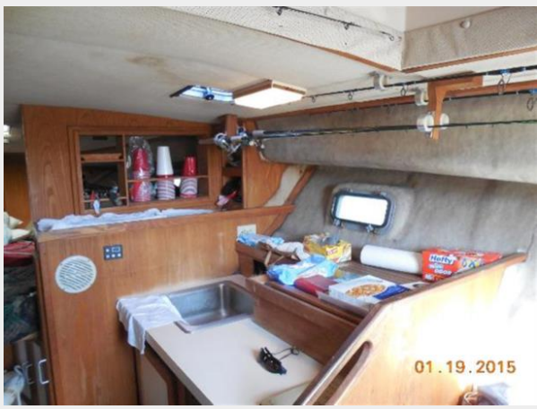
34' Luhrs Open, galley and storage