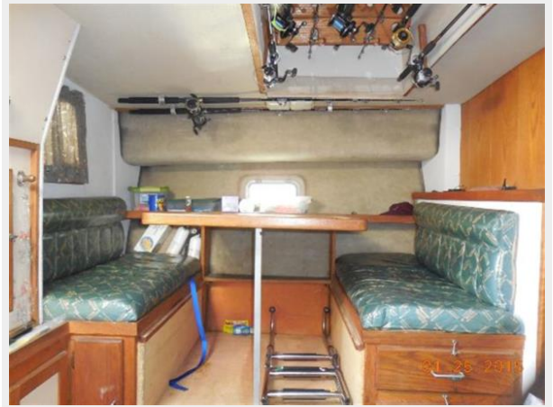
34' Luhrs Open, dinette converts to sleeper