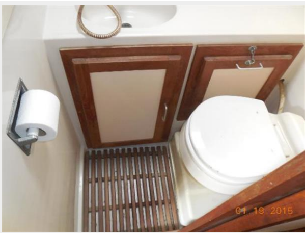
34' Luhrs Open, teak floor in head