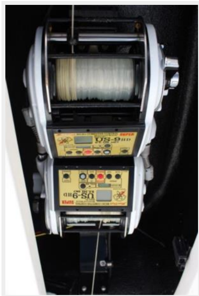
Cockpit / Fishing Equipment 6 - Teaser Reels