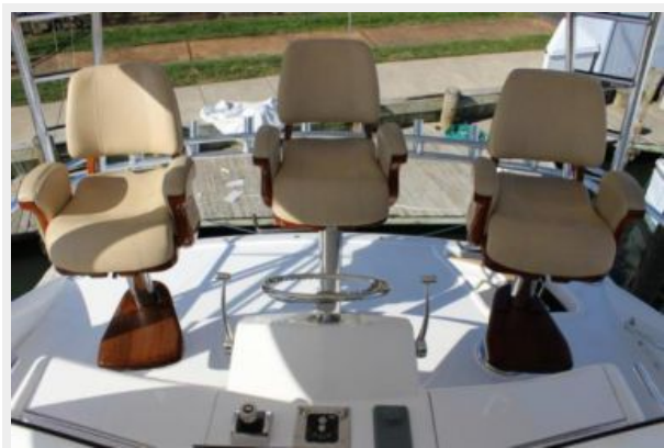
Deck 6 - Helm Seats