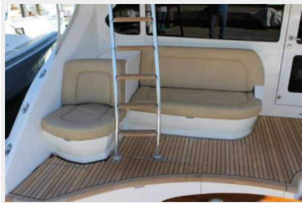
Cockpit / Fishing Equipment 4