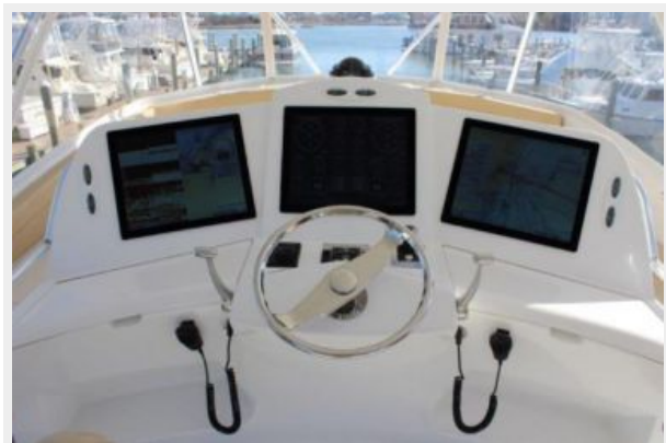
Helm / Electronics & Navigation 2