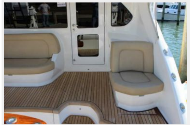
Cockpit / Fishing Equipment 5