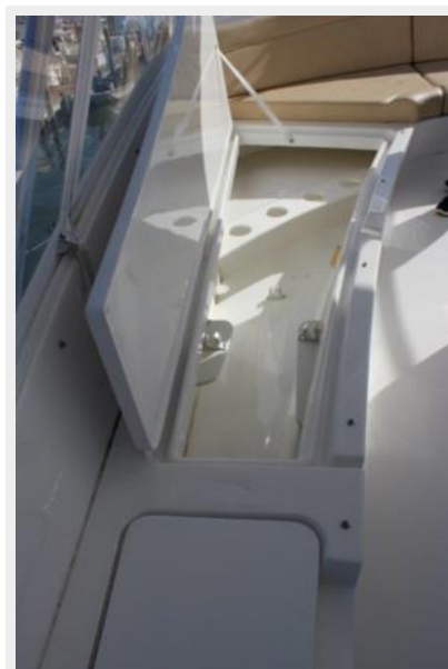
Deck 9 - Port Bridge Rod Locker