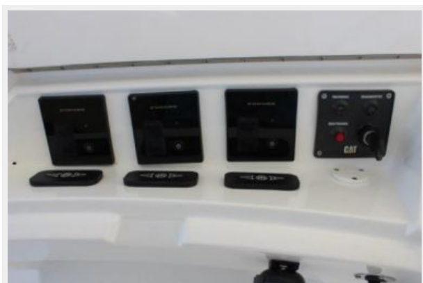
Helm / Electronics & Navigation 4