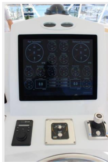
Helm / Electronics & Navigation 3