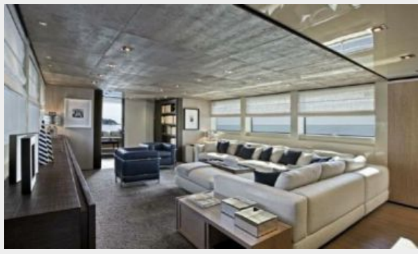
main salon (sister ship)