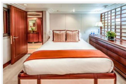
Guest Stateroom Queen