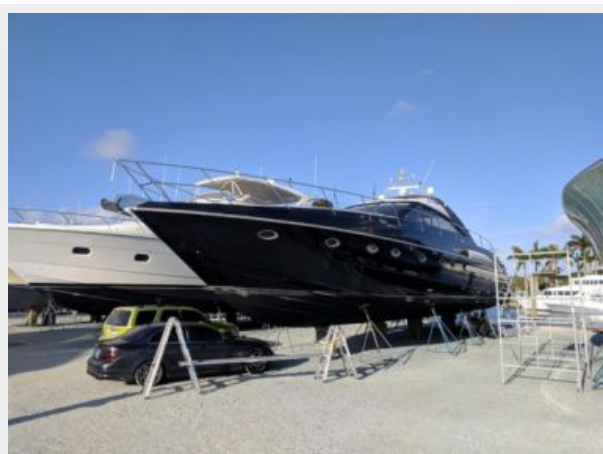
Wrap applied 2