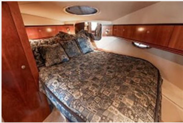
Boat- 011-CDB06373 1