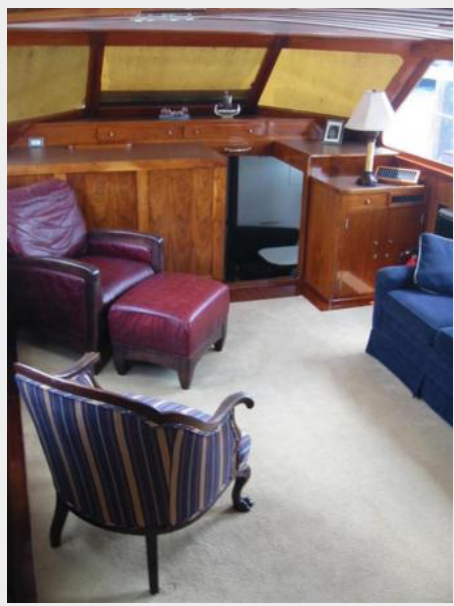
Main Salon Looking Forward