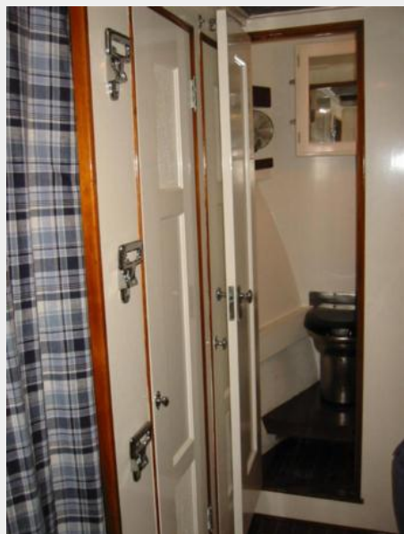
Crew Head/Stall Shower