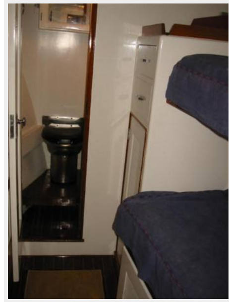
Crew Quarters in Forecastle