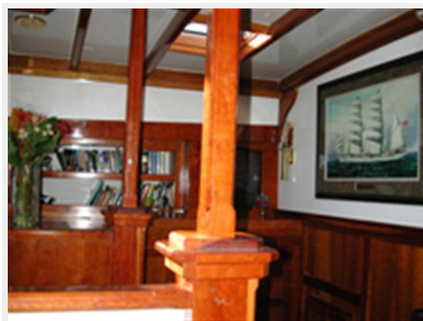
Butterfly Hatch Main Salon