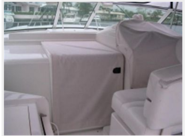
Helm & Companionway covers