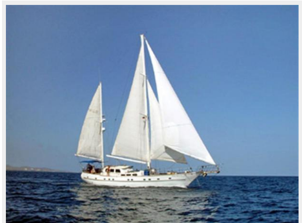
PROFILE - SALES FURLED