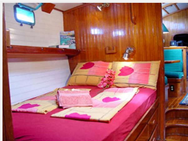
FORWARD DOUBLE BERTH w/ENSUITE BATH