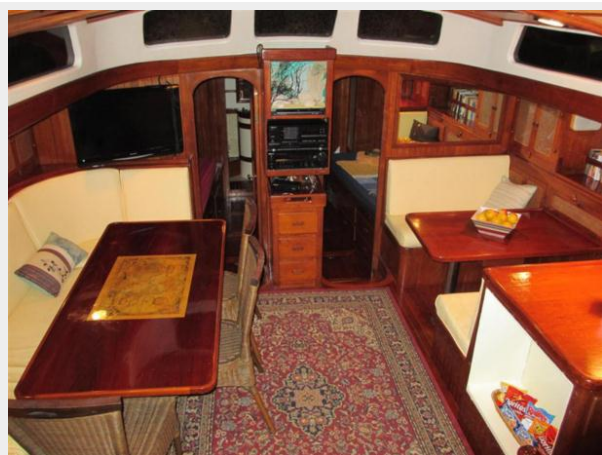
PORTSIDE DINING AREA