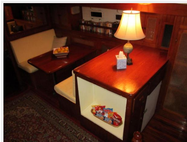
STARBOARD DINING AREA