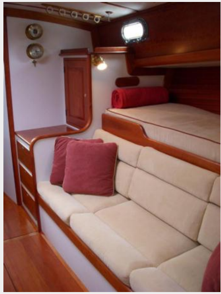
Main Cabin 2