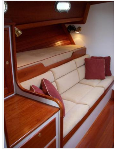
Main Cabin 3