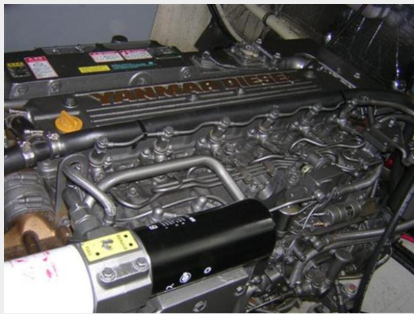
Port Yanmar Diesel