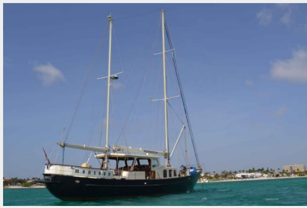
custom motorsailer for sale