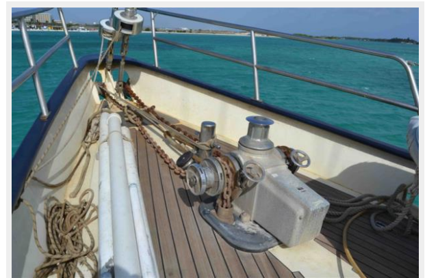
New teak deck