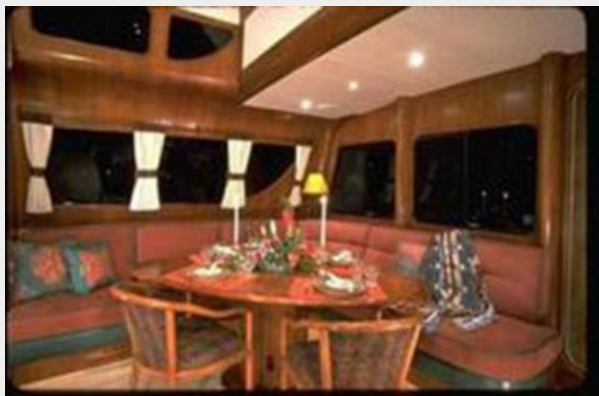
Salon w/ Murphy bed